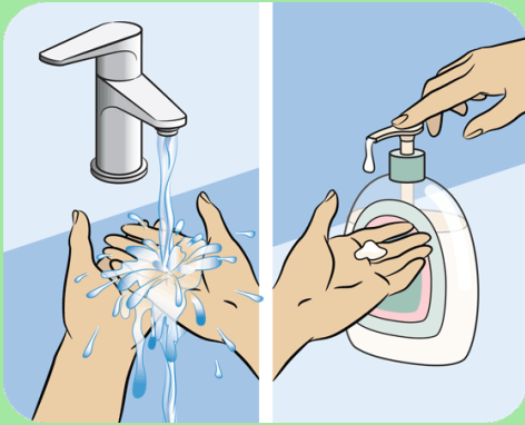
WASH YOUR HANDS WELL & OFTEN WITH SOAP & WATER FOR AT LEAST 20 SEC