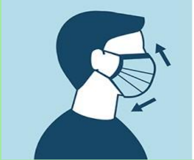
WEAR A MASK IN PUBLIC