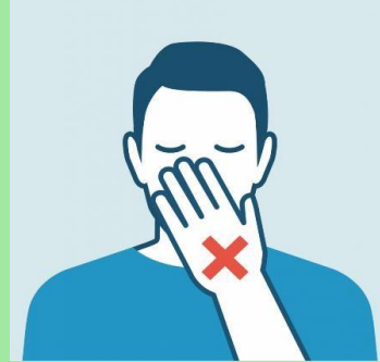
DO NOT TOUCH FACE