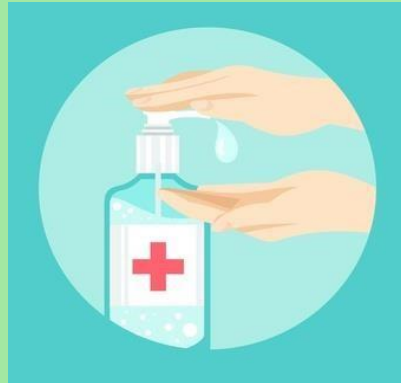
SANITIZE YOUR HANDS